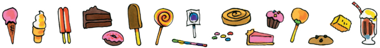
ILLUSTRATION BY VAL CHADWICK BAGLEY