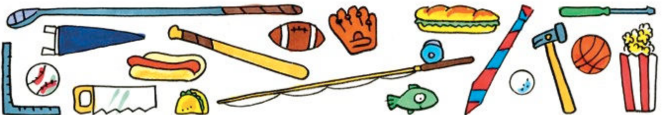
ILLUSTRATION BY VAL CHADWICK BAGLEY